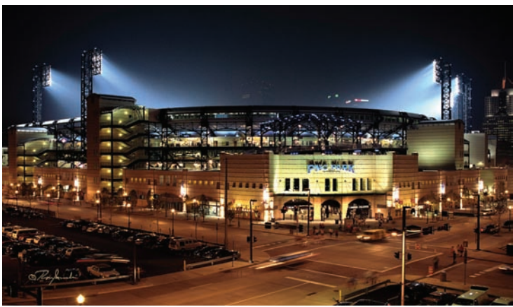
(Pittsburgh's PNC Baseball Park)

Burnham Insulation is very fortunate to have exceptionally talented professionals which pursue an intelligent yet common sense approach to managing your insulation requirements. They are consistent, diligent, reliable, and dedicated professionals, who have demonstrated the ability to provide creative, cost effective solutions to even the most demanding insulation requirements and schedules. Their strengths are logistics, exceptional product and applications knowledge, responsiveness, developing value added business strategies for customers, a tireless work ethic, and each order / inquiry is managed with the appropriate sense of urgency and priority.